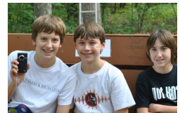
Enjoying last year's Retreat at Camp Hope in Litchfield, CT

begin on Sunday, September 25 for 8th and 9th graders, meeting from 5:30 to 6:30 p.m. To find out more about any of these events and be added to the Youth events mailing list, please contact PJ Drost.